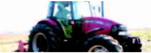
Leeuwfontein Farm 02