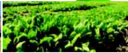
Production plan 06