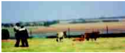
Project partners 03